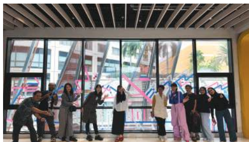
Masking Tape Workshop utilising spaces near the PJPAC entrance