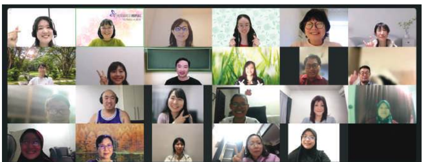
The 5th workshop group photo