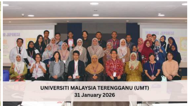
UNIVERSITI MALAYSIA TERENGGANU (UMT) 31 January 2026