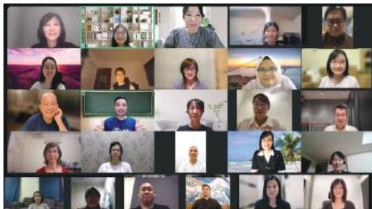
The 2nd workshop group photo

Please stay tuned for announcements about our upcoming workshops on our Facebook and Instagram pages.