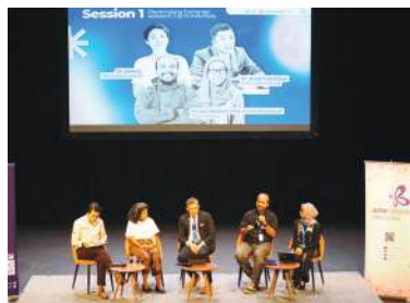
Seminar Session 1: Placemaking Exchange Research Trip to Indonesia

Building up on the success of the first Placemaking Exchange programme in 2024, the second Placemaking Exchange delegation travelled to Indonesia to discover activated spaces and buildings initiated by the community heroes using the placemaking methodology.