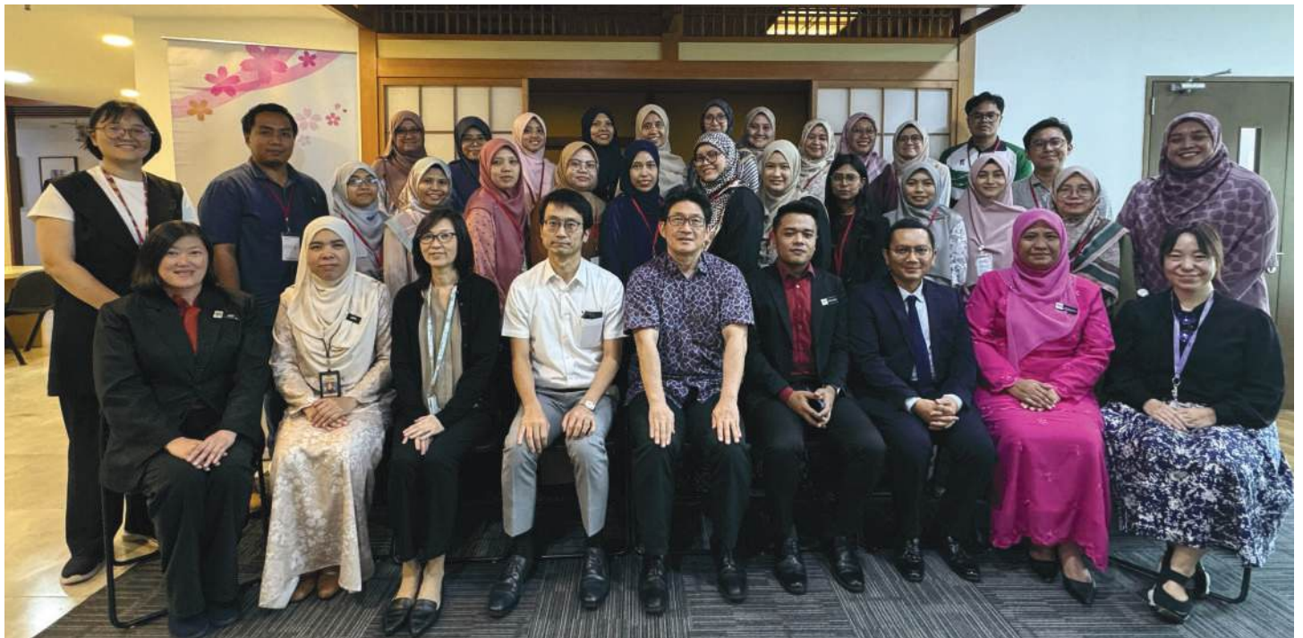
Participants with the JFKL and MOE

Check out our social medias for more information about other programmes tailored for Japanese language educators!