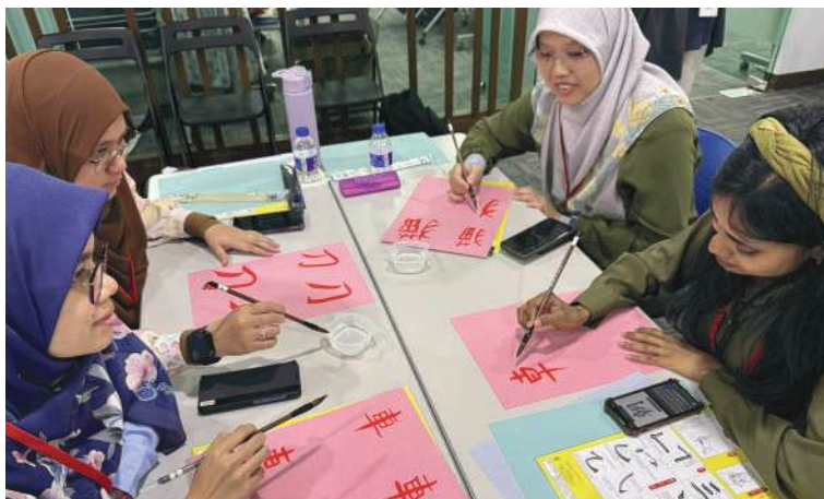
Participants Experiencing Mizushūji