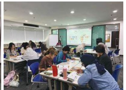
The 3rd workshop Experiencing model lesson