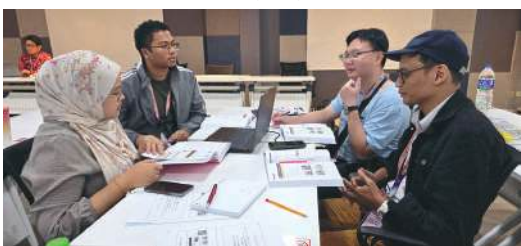
UMT Mock Teaching

*"Irodori" is a Japanese-language coursebook developed by the Japan Foundation. It is specifically designed to help foreign learners acquire the basic Japanese communication skills necessary for daily life and work in Japan. For more information, visit www.irodori.jpf.go.jp/en/ or scan the QR code.