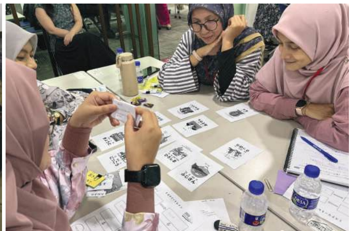
Participants Experiencing Classroom Activities