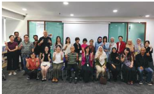
The 3rd workshop group photo