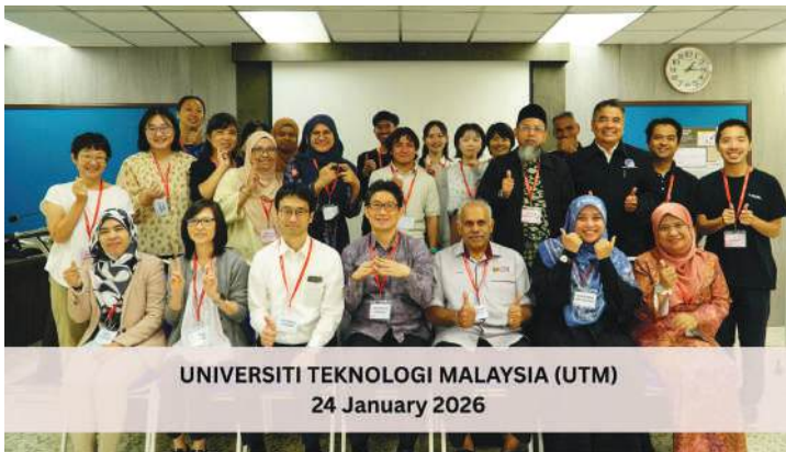
UNIVERSITI TEKNOLOGI MALAYSIA (UTM) 24 January 2026

Through these collaborative efforts, the workshops successfully equipped a diverse group of educators and learners with practical tools for Japanese language instructions. By fostering direct engagement between JFKL, the MOE, and local educational institutions, the event strengthened the network of Japanese language education in Malaysia. We look forward to seeing how these participants implement the Irodori curriculum to help learners build the essential communication skills needed. We are deeply grateful to UTM and UMT for their partnership in creating such a valuable platform for hands-on learning. It is our hope that the resources provided, particularly the A1 level textbook, will serve as a foundation for continued growth and inspired teaching within the community.