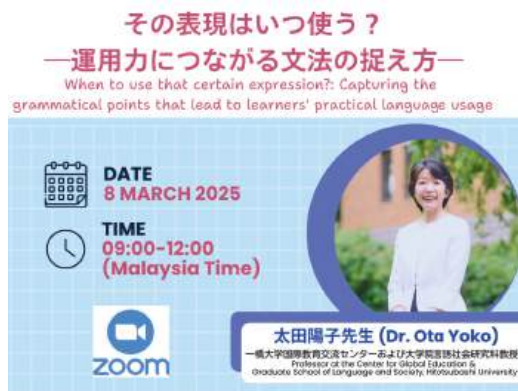
The seminar and the speaker

In summary, the seminar provided a valuable platform for Japanese language educators across the region to engage with new ideas, connect theory with practice, and rethink how grammar can be taught in the classroom. This annual seminar will return with a new theme in March 2026. See you again!