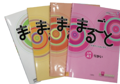
MARUGOTO: Japanese Language and Culture