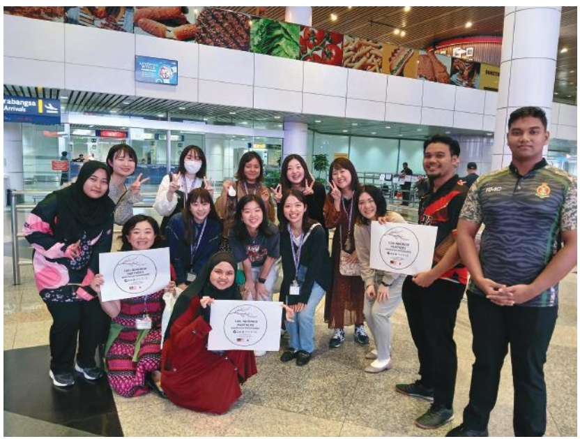
UPSI welcomed NPs at KLIA on 12 March

NIHONGO Partners, or NPs, are Japanese citizens who volunteer to support Japanese language education mainly in secondary schools in Asia by assisting the non-native Japanese language teachers. This year marked the tenth year that NPs are being dispatched to Malaysia since its commencement in 2015. The 10th Batch welcomed 10 volunteers, bringing the total of NPs sent to Malaysia to 172 with 124 participating host schools as of 2024. These NPs arrived in Malaysia on 12 March and underwent a post-arrival orientation for 3 weeks before being stationed at respective schools starting 29 March. This year, the NPs have been posted to 7 states in Peninsular Malaysia (Kedah, Penang, Kelantan, Selangor, Kuala Lumpur, Negeri Sembilan, Johor) and Sarawak. They started their mission as Japanese language and culture assistants at the schools until 4 November and will be returning to Japan on 7 November after attending the year-end report meeting in Kuala Lumpur. To prepare them for this mission, they went through orientation sessions in Japan as well.