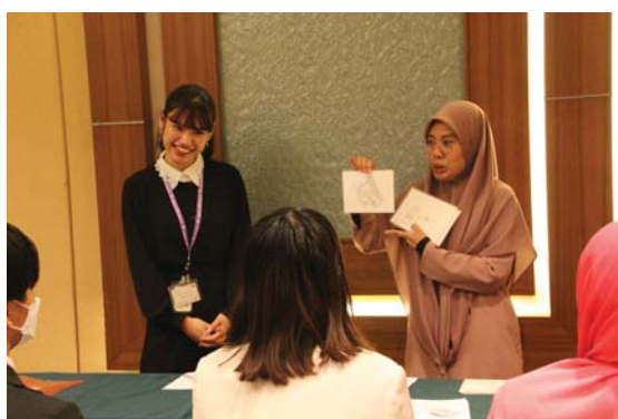
CP-NP Mock Session