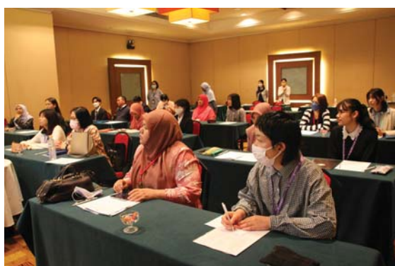
CP-NP joint session

At the end of immersion programme on 24 March, NPs headed to Kuala Lumpur to undergo their next training with JFKL officers, Japanese language lecturers and experts. From 27 until 31 March, NPs were briefed on official matters, life in Malaysia, and introduced to Malaysian schools and what to expect during their 7-month-long stay in Malaysia. NPs also underwent training on Japanese teaching methods with JFKL lecturers and experts where they reviewed Japanese writing systems, pronunciation, vocabulary, and grammar from the point of view of a teacher, as well as learn how to use teacher talk and introduce Japanese culture.