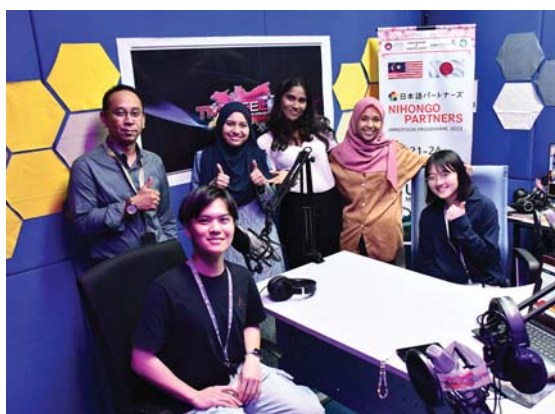
TMFaceLive experience at UPSI