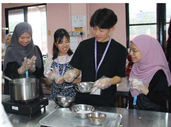
Ondeh-ondeh (a traditional Malay delicacy) making session with the buddies