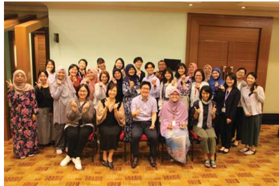
The end of post-arrival orientation

These NPs started their training in Malay language and Japanese language education in Japan, and the post-arrival orientation solidified the experience through authentic participation in UPSI and interaction with JFKL officers, lecturers and experts, and CPs. We hope the NPs will be able to contribute to their local community by introducing Japanese culture and language, also experience Malaysian life with enthusiasm. JFKL will report on their activities through the upcoming issues of Teman Baru and our social media.