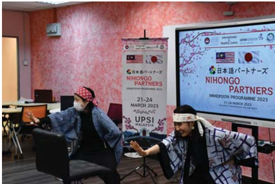
NPs performing Soran Bushi dance during immersion programme

The final week of their orientation was the 3-day joint-training session from 3 until 5 April with their Counterpart Teachers (CP), whom they will be assisting until the end of the programme. The aim of this final session was to introduce NPs to CPs, build a balanced working partnership, and provide resources to enhance class activities in schools. During the session, NPs, who were equipped with basic training from JFKL lecturers and experts, teamed up with CPs to conduct a mock class as their first collaboration. Prior to the joint training, the CPs had a separate online session with JFKL lecturers and experts where they planned lessons utilizing NPs, which were used during the mock class. Apart from that, the joint training also consisted of general briefing from JFKL and Ministry of Education (MOE) officers to the CPs.