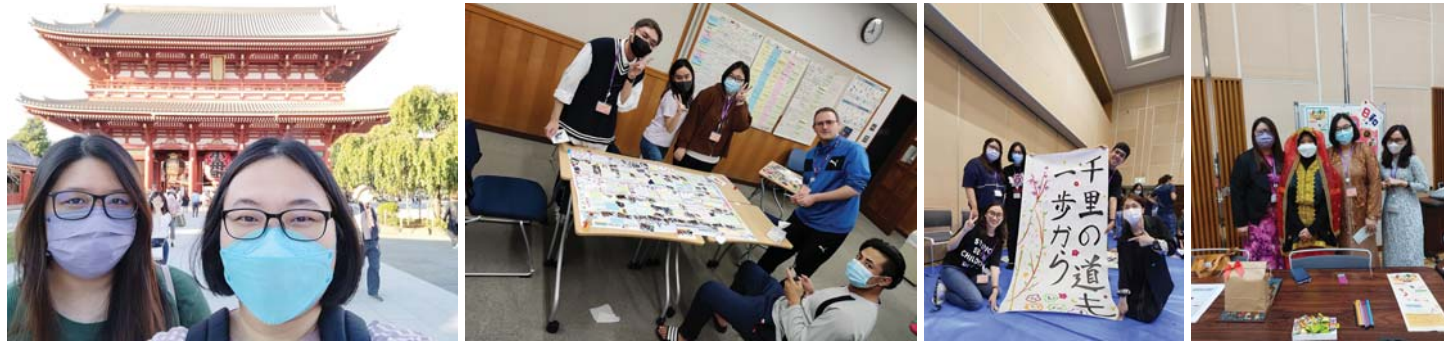
The two participants from Malaysia

This on-site training program was halted in 2020 and 2021 due to pandemic but resumed in 2022 and is scheduled to continue in 2023. Apart from the Basic Training Program, the Japan Foundation also offers various other training programs for Japanese language teachers. For those who are interested in participating in the future, please visit: https://www.jpf.go.jp/e/urawa/e_trnng_t.html or you may like and follow us on Facebook and Instagram to get the first-hand information once the application opens.