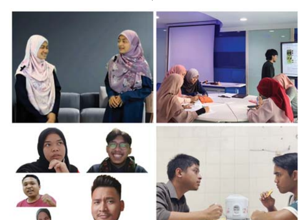
Scenes from 2nd - 5th place winners' skits