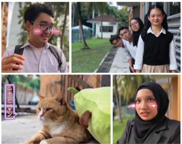
Scenes from 1st place winner's skit.