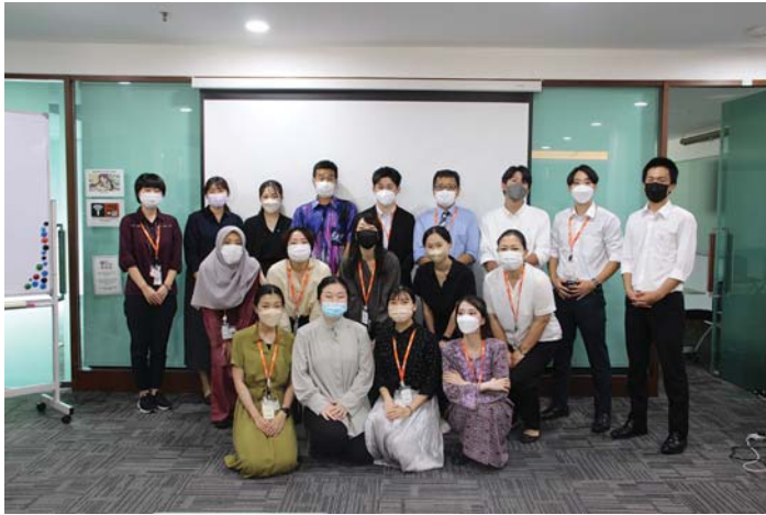
All 18 NPs during mid-term interim session

Since their dispatch to local secondary schools in 9 states in April, the Japanese volunteers known as NIHONGO Partners (NP) have been actively introducing Japanese language and culture to students at their respective host schools and local communities. Two notable events they have been involved in so far were courtesy visits in May and the mid-term interim session in June.