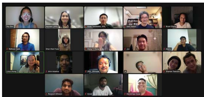
First meeting with all the artists