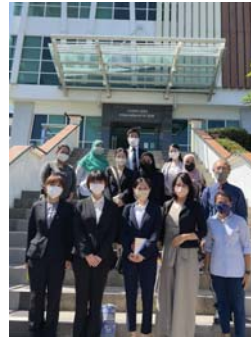
Courtesy call to JCC-KUFS-USM