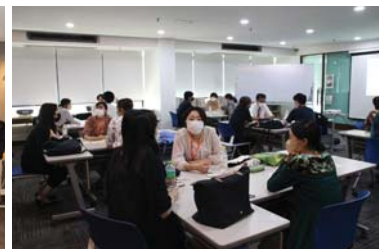
NPs in group discussion during mid-term interim session