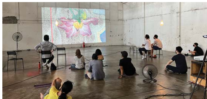
During the Pre-launch event at KongsikL