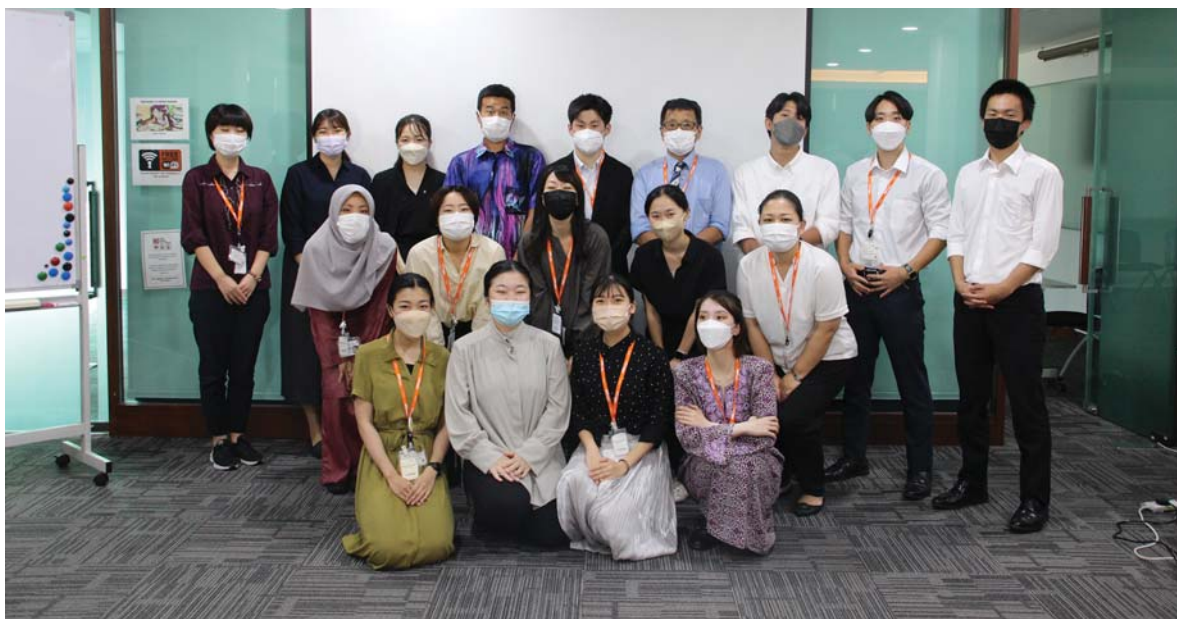
NIHONGO Partners 8th Batch