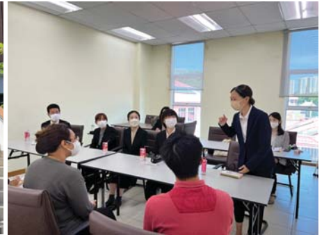
Free talk session with USM students