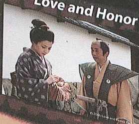
Love and Honor

The Japan Foundation, Kuala Lumpur at 03-2161 2104 or log on to www.jfkl.org.my