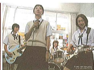
Linda Linda Linda