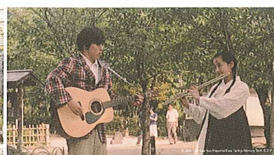
We Shall Overcome Someday