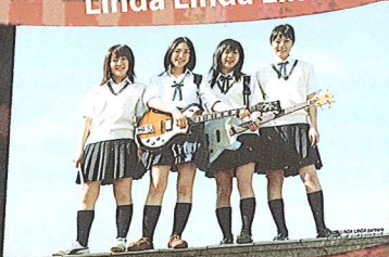
Linda Linda Linda