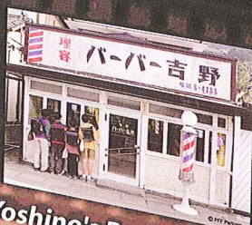
Yoshino's Barber Shop