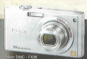
New: DMC - FX36