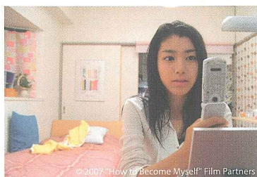
How to Become Myself