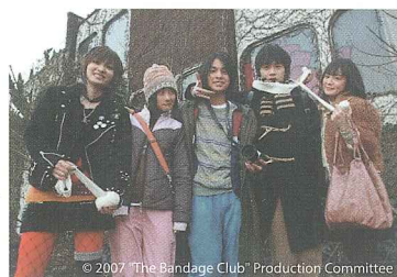
The Bandage Club