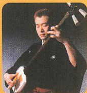
SAWADA Katsuharu ( Tsugaru-Jamisen )