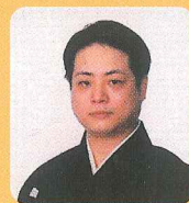
FUJIMOTO Atsuhide ( Shamisen )