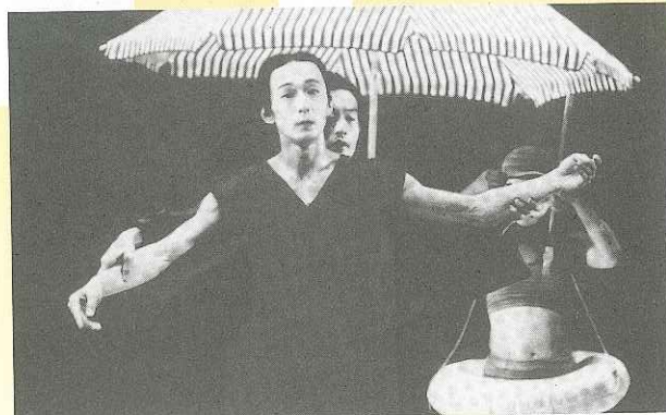
A scene from Pappa Tarahumara