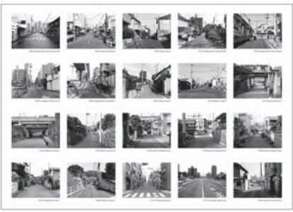
Perspective, Sendai Collection Vol.1 Sendai Collection 2000-2003 728 x 1030 Lambda print