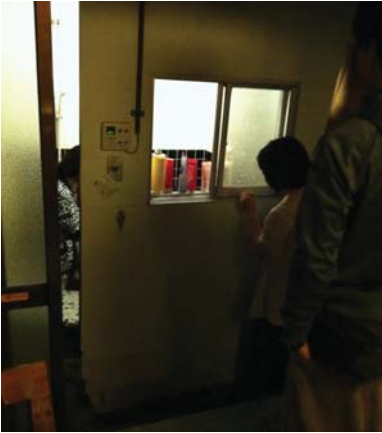
A Doll House at Factory Kyoto - A site-specific performance that extended into the bathroom of an old Kyoto house.