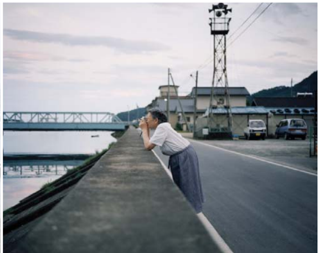
Kesengawa, 2003/08/23 Naoya Hatakeyama 2003 279 x 356 C-type print