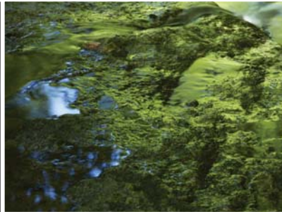
Reflection of Green Beech Woods Meiki Lin 2011 728 x 1030, Lambda print