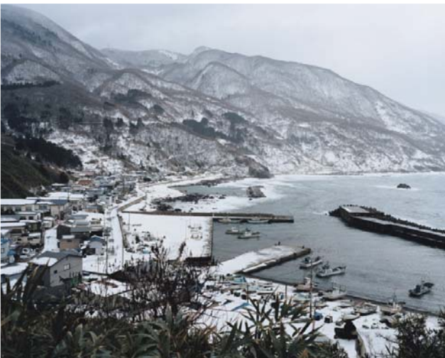
Kamaoosa, Akita, FIELD NOTES (Jomon Sites / Oga Peninsula / Yonomori) Nao Tsuda 2011 457 x 560, C-type print