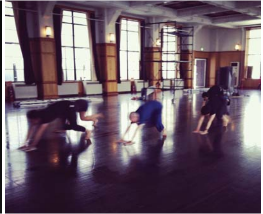
Cast and crew of Ka-mome Za's CLEANSED project bumping-out