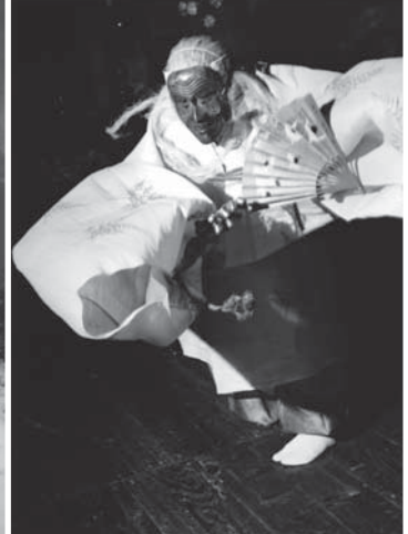
Longevity Dance, Motsuji Temple, Hiraizumi, Iwate Hideo Haga 1979 560 x 457, Gelatin Silver Print Courtesy of Artist