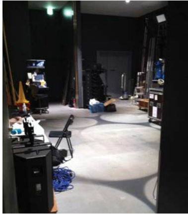
Za-Koenji's notorious spotted design extends even backstage