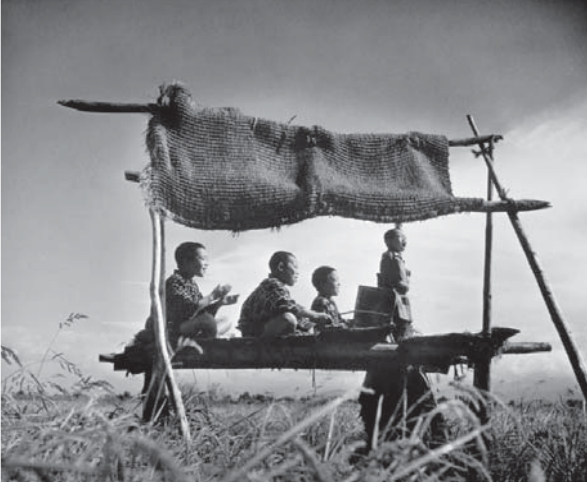
Driving off Sparrows, Kitsunozaka, Taiyu Village Teisuke Chiba C.1943 457 x 560, Lambda print

For more details, please visit our website www.jfkl.org.my