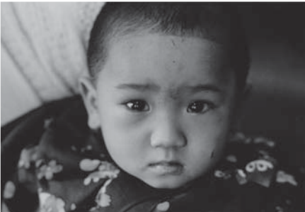
Ohamaza-cho, La Ville de la chance Hiroshi Oshima 1979 457 x 560, Gelatin Silver Print