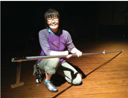
To 'jolok' the lights. A standard lighting tool in high-tech Japan