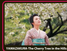
YAMAZAKURA-The Cherry Tree in the Hills

For more info and screening schedule please visit our website at www.jfkl.org.my or call JFKL at 03-22846228 for more details.