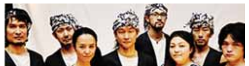
TAIKUH JIKANG Members

Supported by: ASAHI BEER ARTS FOUNDATION