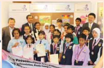
Group Photo with the finalists