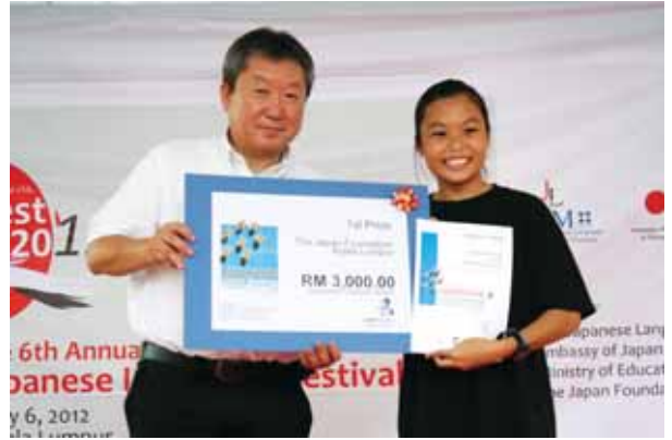
Presentation of the cultural grant to SMK (P) Methodist Klang, winner of the 2nd Annual Japanese Choral Speaking Competition