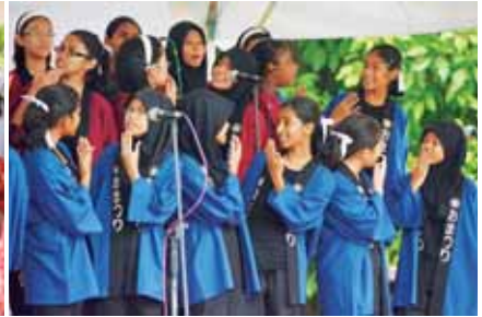
Japanese Choral Speaking Competition