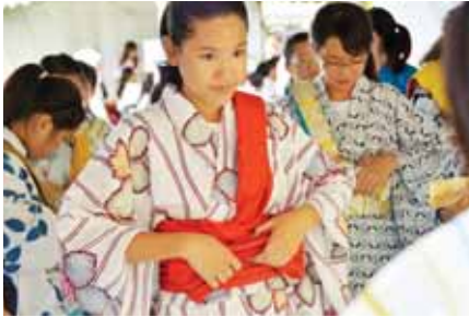
Yukata Wearing Workshop

JFKL is very proud to be associated with this event together with the Japanese Language Society of Malaysia, the Embassy of Japan in Malaysia and the Ministry of Education Malaysia.