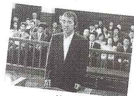
Half a Confession

Hols is a very strong boy skilled with axe. One day, Moog, a gigantic stone golem, saves him from an attack of a pack of demonic wolves. Hols helps Moog to pull an old sword out of the creature's shoulder, which Moog explains is the Sword of the Sun. Moog declares that if Hols can succeed in reforging the sword, which is useless now, he will honor Hols as the next prince of the Sun.