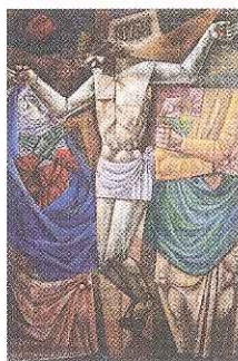
"Crucifixion" by Galo B. Ocampo

The Japan Foundation and the National Museum of Modern Art, Tokyo, are holding an exhibition entitled "Cubism in Asia: Unbounded Dialogues," together with the National Museum of Contemporary Art, Korea, and Singapore Art Museum. This exhibition is the first attempt to focus on the influence of and reaction in Asia to the Cubism movement, and it presents 130 works from 11 Asian countries namely Malaysia, China, India, Indonesia, Japan, Korea, The Philippines, Singapore, Sri Lanka, Thailand and Vietnam. Among all those works, there are 6 artworks by Malaysian artists. This exhibition will also tour to Seoul and Singapore after Tokyo.