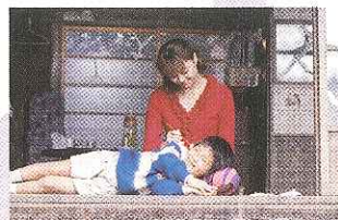
Bokunchi - My House