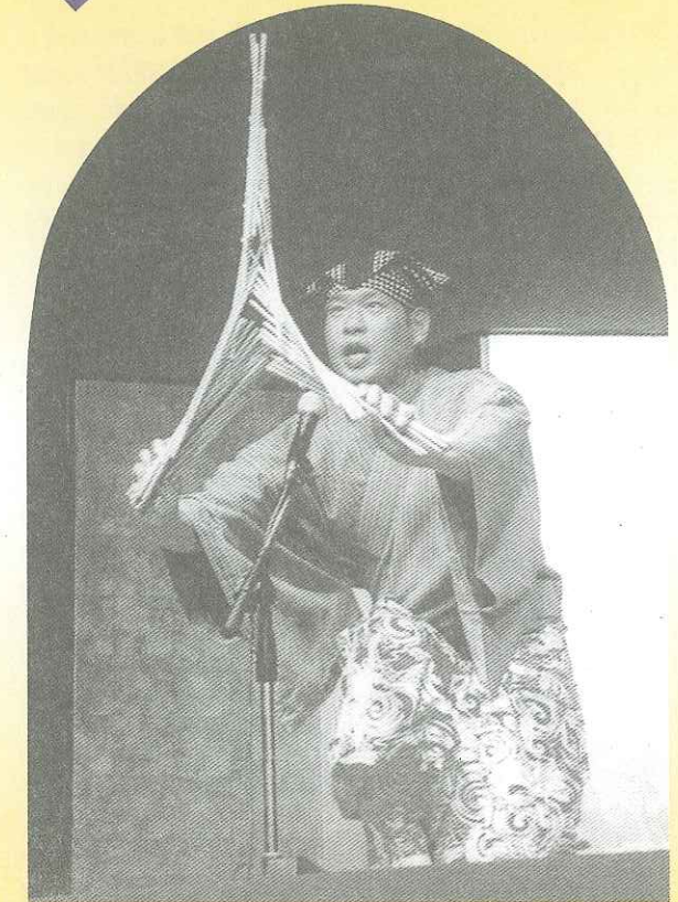
Rakugo Performance-scenes -see inside for details-