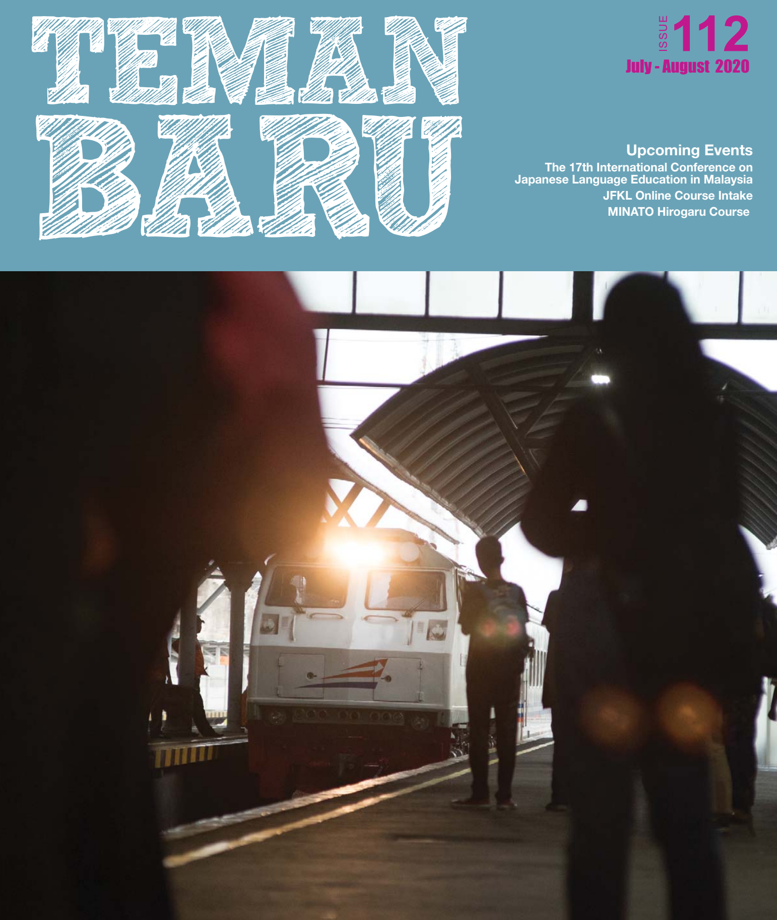
Photo of Tugu Station, Jogjakarta. Full report on page 8.

JAPAN FOUNDATION KUALA LUMPUR BIMONTHLY NEWSLETTER