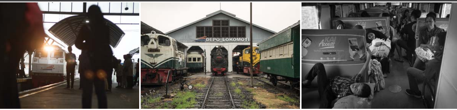
Passengers waiting for the train at Tugu Station, Jogjakarta.

Written by Mahen Bala, The Asia Center Fellow (FY 2019) Fellowship Period in Indonesia is from 8 December 2019 – 8 February 2020