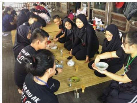
Sado workshop at Sarawak Bon Fest