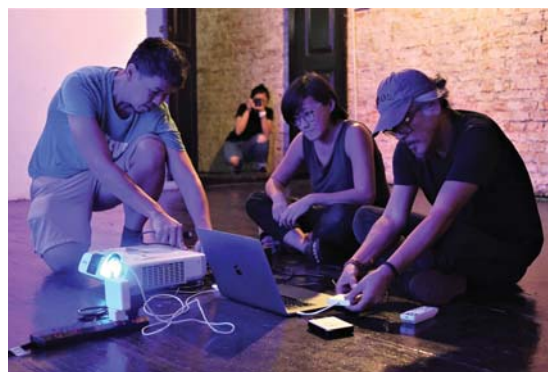
Artists of the SeaShorts 2019 Night Bells Film Installations setting up the space of the installations