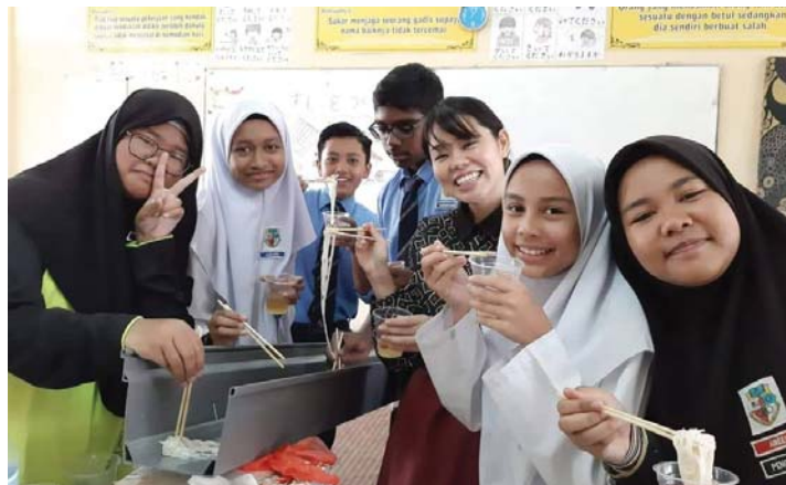
Nagashi somen at school

Aside from Nagashi Somen, there are a myriad of other activities conducted by the NPs with their CPs’ guidance. The Japanese Tea Ceremony or “Sado” was a way to get the students to understand this traditional art and try the bitter green tea. The close-knit NPs communicated with each-other and shared their ideas on what other activities they could carry out at schools and events. One of the skills they learned from each other was how to craft “Tsumami Zaiku”, small flower ornaments made from Japanese cloths that can be crafted into various accessories. During joint-events throughout their term in Malaysia, the NPs set up Tsumami Zaiku workshops and taught visitors how to make this handicraft to take home as a memento.