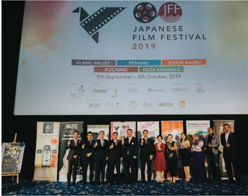
Sponsors & Partners