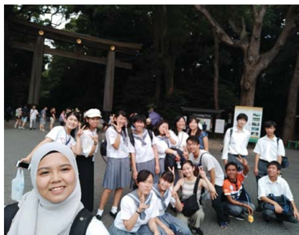
Tokyo sightseeing with Sakuragaoka high school students

(The citations of the article are originally from the author herself)