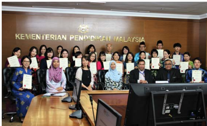
Commemorative photo at KPM

After a duration of 8 months volunteering as Nihongo Partners, 24 Japanese returned safely to their home country on 3 October 2019.