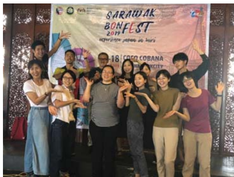
Sarawak Bon Fest