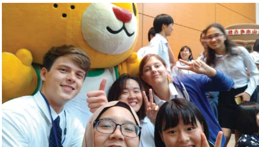
Enjoying the Animation Experience Class in Tokyo