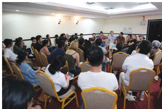
Roundtables of Southeast Asian filmmakers to discuss on the challenges and future of filmmaking industry in Southeast Asian