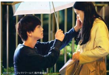
Perfect World (パーフェクトワールド / Pāfekuto wārudo) SHIBAYAMA Kenji 柴山健次 • 2018 • 103 min • Romance (P13)

A dowdy antiques dealer Norio finds a valuable teacup of the most famous Japanese tea master Sen no Rikyū from the 16th century when searching inside a storehouse of a rich family. Norio deceives the homeowner Sasuke to get it for almost nothing, but it turns out that Sasuke is not a mere house-sitter but the creator of the teacup. When Norio learns that Sasuke used to be a promising potter derailed by an antiques authenticator with whom Norio himself also happens to have a painful history, the two of them decide to take a gamble of a lifetime against the authenticator to settle their scores.