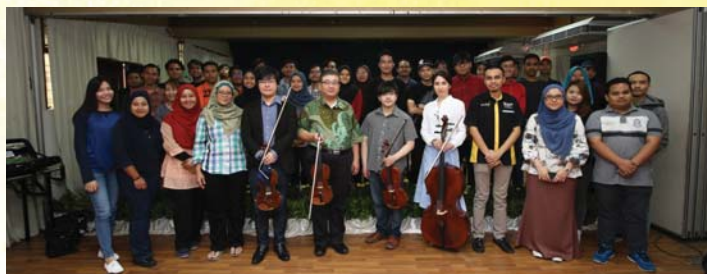
Group picture of the Schelm String Quartet with the UiTM Faculty of Music's Composition Department