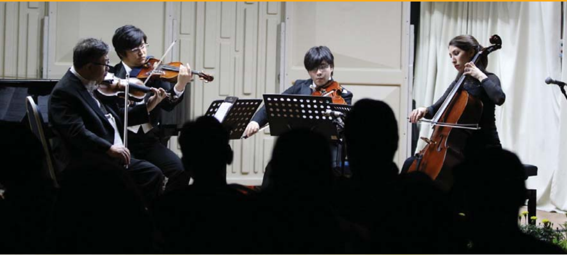
Schelm String Quartet in concert