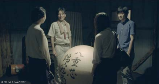
© '18 Bai & Souzai' 2017