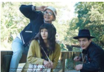
The Gift of Memory/ The Gift of Memory ~Ça va? (うつくしいひと / うつくしいひとサバ? / Utsukushii Hito / Utsukushii Hito sa va?) YUKISADA Isao 行定勲 • 2016/2017 • 40 min + 45 min • Drama (P13)

Mami doesn't have a job and is closed off in her own world. Her father Eisuke struggles to strike the right distance from her and worries about her future, so he finds her a job debugging videogames. She silently plays videogames for a job that wasn't supposed to involve talking with anyone, but things don't go as planned.