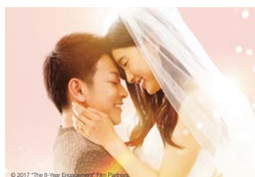
The 8-Year Engagement ( 8年越しの花嫁 奇跡の実話 / 8 Nen Goshi no Hanayome ) ZEZE Takahisa 瀬々敬久 • 2017 • 120 min • Romance (P13)

Tamako, who was once known as a "table tennis girl wonder", was in a relationship with Ejima, the ace of her company's table tennis club, until another player, Airi, steals him away. Returning to her hometown, Tamako meets the members of the table tennis club her deceased mother had operated, including Hagiwara. She resolves to qualify the members of the Flower Table Tennis Club for the National Championships in the mixed doubles category in order to reinvigorate the Club and destroy the Ejima-Airi pair.