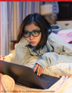
© 2017 (The Tale of Ai You Wan) Production Committee