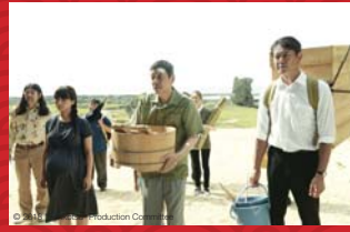
© 2017 "The 8-Year Engagement" Film Partners