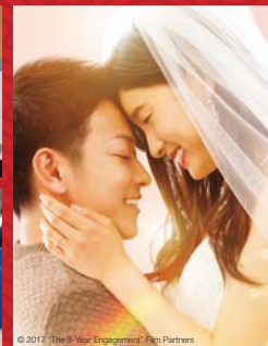
© 2017 "The 8-Year Engagement" Film Partners