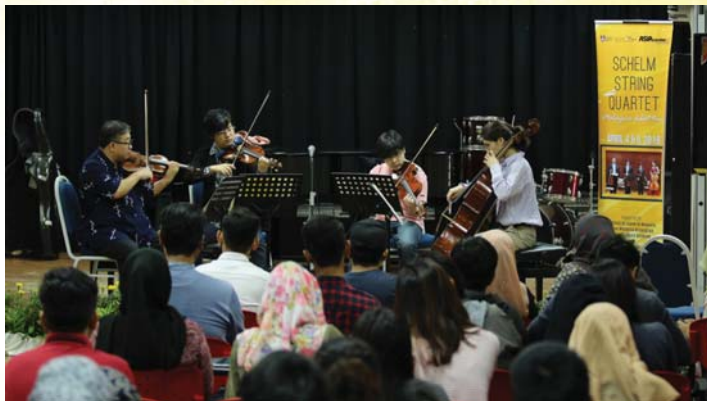
Schelm String Quartet demonstrates different stylistic interpretations during their workshop with the music education students