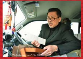
© 2016 "We Make Ancestors" Film Partners