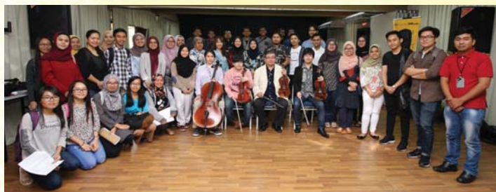
Group picture of the Schelm String Quartet with the UiTM Faculty of Music's Music Education Department