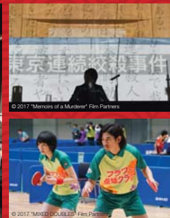
© 2017 "Memories of a Murderer" Film Partners