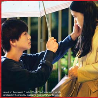
Based on the manga "Perfect World" by Rie Arino, originally serialized in the monthly magazine Kisei by KODANSHA LTD.