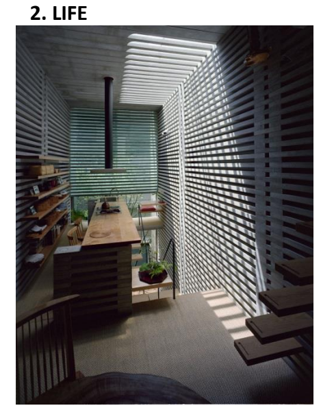
Layer House 2003, Hiroaki Otani, © Kohji Okamoto