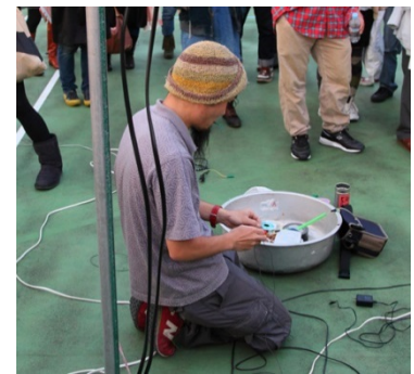
Speed Switching, 2010, Dimension Variable

HORIO Kanta (b. 1978, Hiroshima) studied Acoustics at Kyushu Institute of Design. His performance and installation works are assembled with self-made circuits, mechanical structures and objects found around him. His works were shown in several international festivals and exhibitions including Sónar (Barcelona, 2006), Time Based Art Festival (Portland, 2007), The Kitchen (New York, 2007), International Festival for Arts and Media (Yokohama, 2009), EXIT festival (Paris, 2010), ensembles2010 (Art Tower Mito, 2010), Manifestation internationale d'art de Québec (Quebec, 2012). He is also an engineer of electronic devices and interactive systems for commercial projects including installations, events, films, or prototypes.