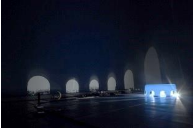
(c) 2010 Ryota Kuwakubo

2 Malaysian Curators worked with Japan and 5 ASEAN Countries