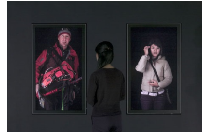
sight seeing spot(2007)